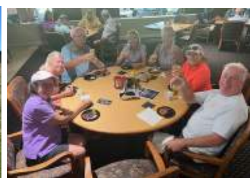
TWIN ISLES COUNTRY CLUB I Page 17